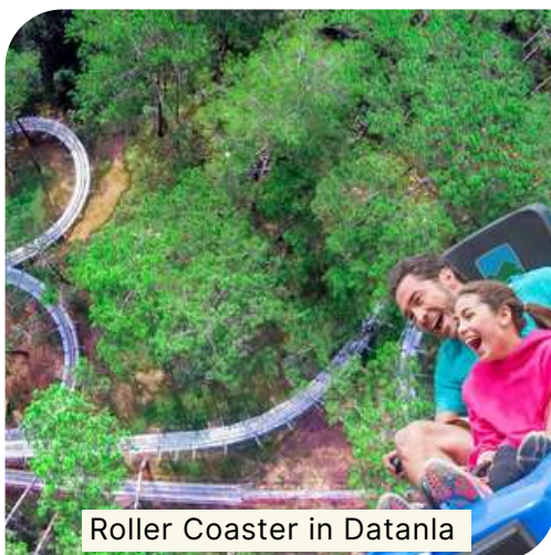
Roller Coaster in Datanla