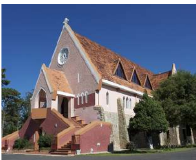
Domaine de Marie Church

Suggested flight: AK571 KUL DLI 11:00 12:10 (Airfares excluded)