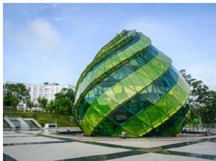
Lam Vien Square